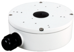
A22 Junction Box